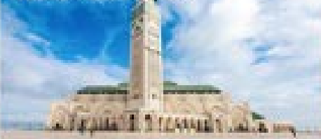
Hassan II Mosque